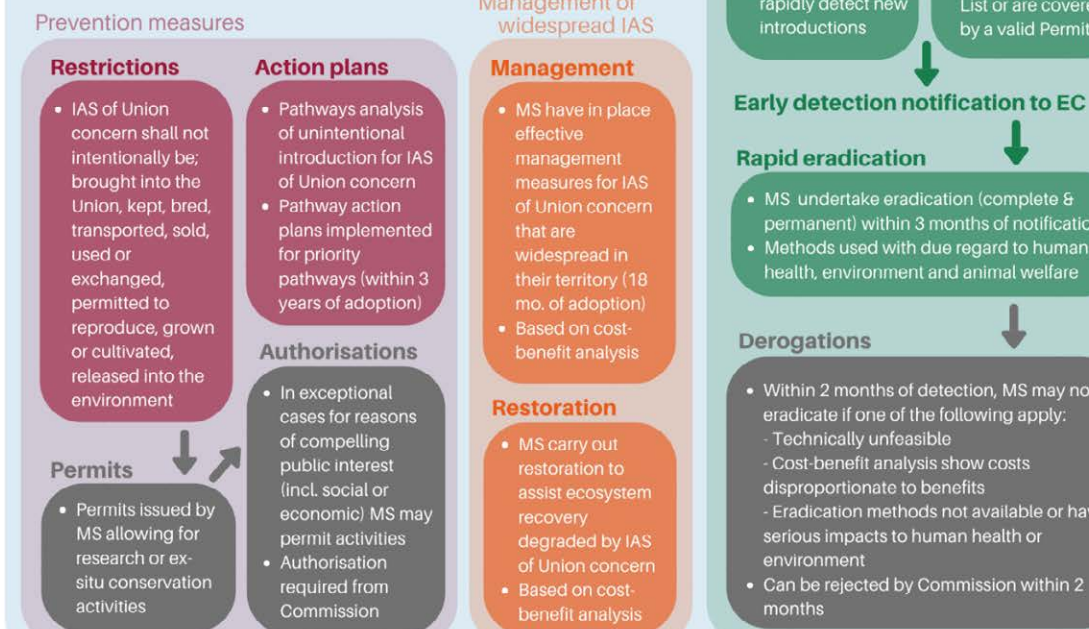
Figure 1. Key provisions of the EU IAS Regulation

2019 = 17 species listed (4 animals and 13 plants)