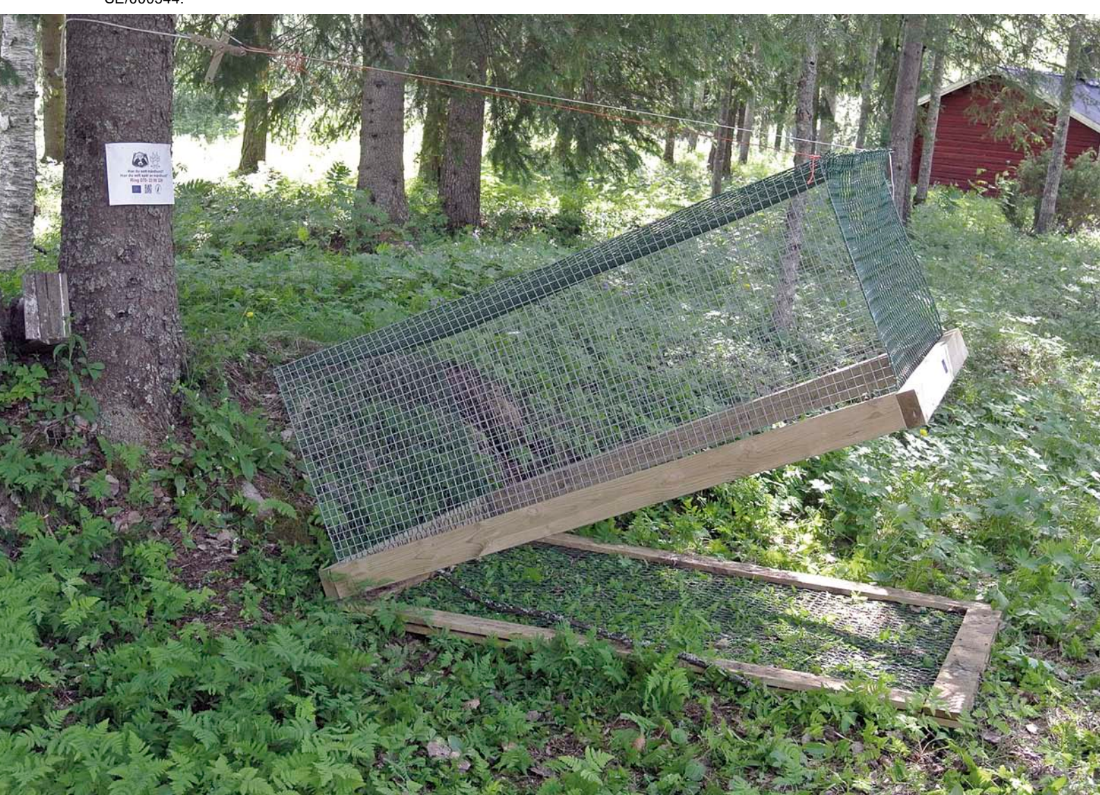
Using traps as part of the management of the Raccoon Dog ( Nyctereutes procyonoides ) in the north-European countries © LIFE09 NAT/ SE/000344.

The manual can be accessed on the <u>European Commission (EC) page on IAS</u>.